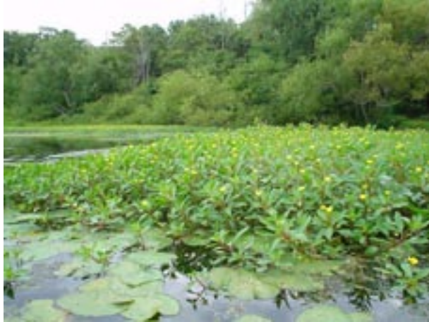
Water primrose ( Ludwigia peploides ), native to South America First seen in Peconic Lake in 2003

And we need YOUR help to rid the Peconic River of this invader that threatens the river's ecosystem and recreational opportunities it supports!