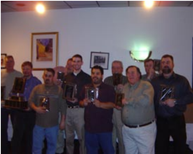
Some of the Award Recipients